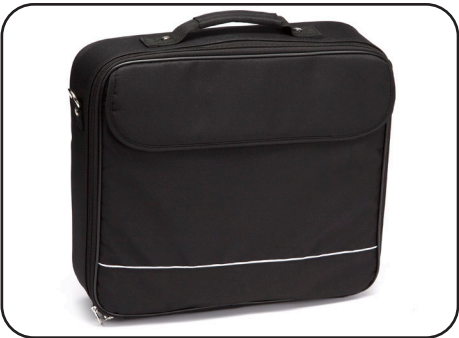
T-2000 is delivered in a soft case