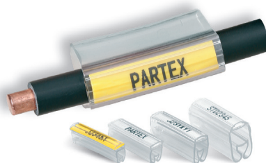
PP+ profile in PT+ sleeve