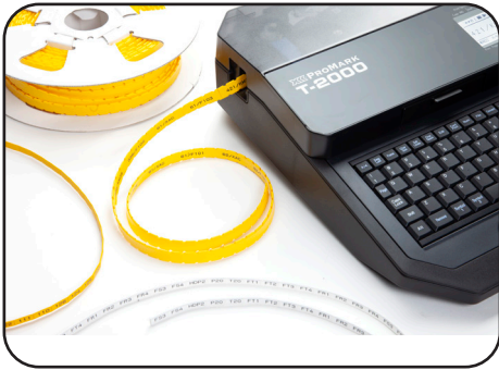
T-2000 prints on Partex profiles. Choose which profile you are printing on and the machine adjusts cutting depth and print position.