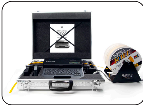
It is possibility to upgrade to a hard aluminium case to ensure safe transportation of the machine.