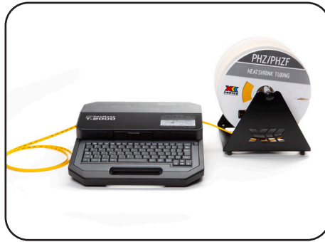
T-2000 is delivered with a reel stand for SN- and DN-reels.