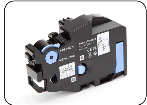
Profile heater (optional) helps achieve optimal print quality even at low temperatures (+5C to +18C)