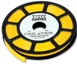
Compactdisc with PO-profile