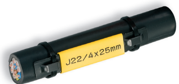
PO-068TW on POH