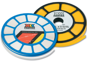
Compacta disc with PP+ profile