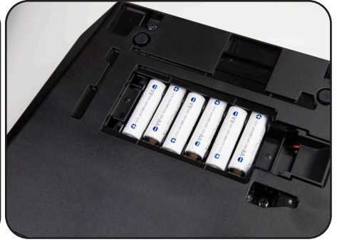
Power supply via mains or via 6 AA-batteries with a capacity of 1900 mAh each.