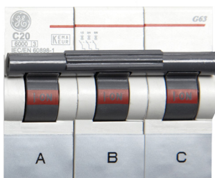
T-2000 also print on labels