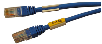
PP+ profile in PTC sleeve