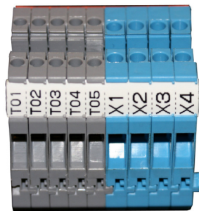
PP+ profile mounted on blocks