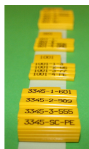
Sorted on a sheet.