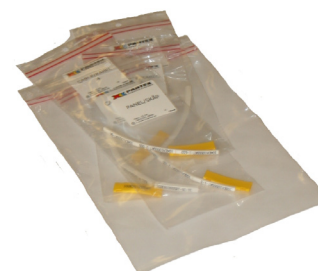
Double-sorted by cable and cabinet